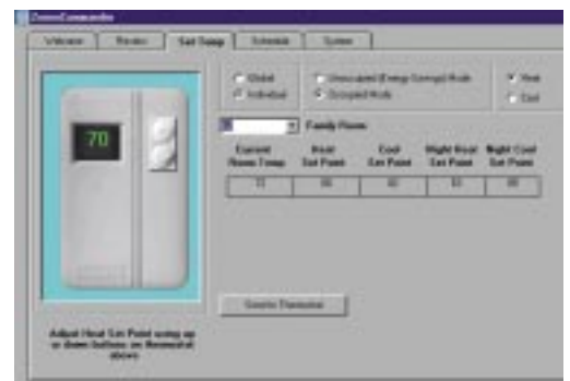
Review Screen – The ZonexCommander permits on-line interactive review of your HVAC operating data.